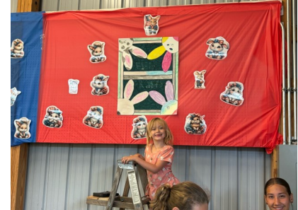
Rabbit and Poultry Barn Set Up