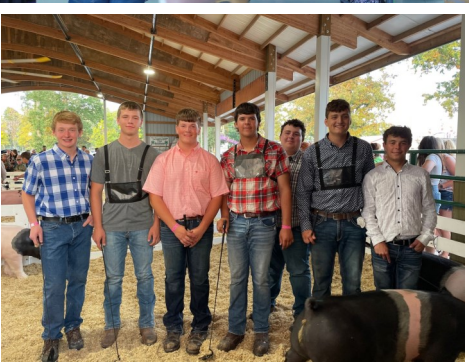
Grade 11 Hog Showmanship.